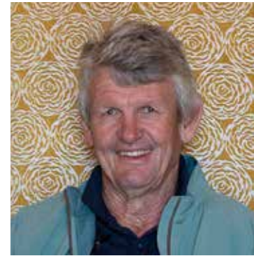
MORNÉ DU PLESSIS

When I was playing, I saw all the hard work and effort that was put into looking after players that had suffered catastrophic injuries. Being closer to the Players' Fund has given me the opportunity to give back to the game that has given me so much. I can't stress the importance of the Players' Fund in South African rugby enough. It offers injured players the opportunity to develop a purpose, to inspire and to provide hope.